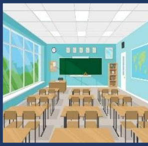
March 18, 2024