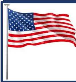
Pledge of Allegiance